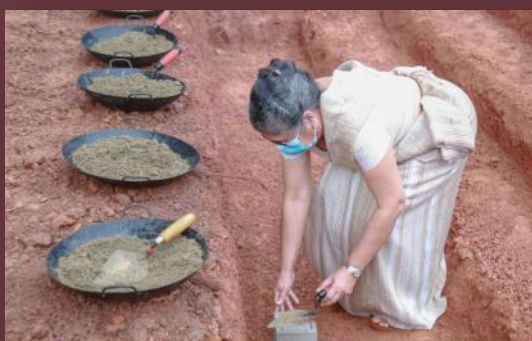
Cornerstone Ceremony on 16th September 2021