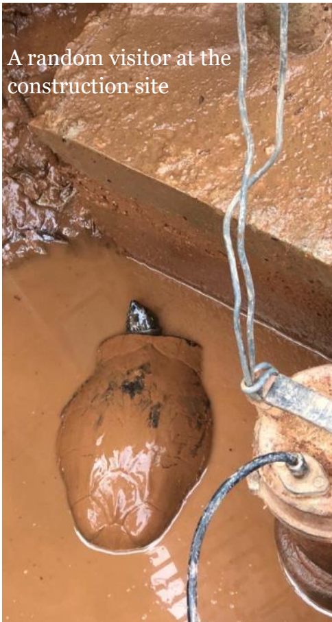
A random visitor at the construction site

Challenges in the current era in meeting the national need. Symposium in liver disease and transplant, 30th Anniversary Academic Sessions, University of Kelaniya, Sri Lanka