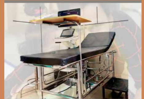
Bed for imaging unit by a well wisher